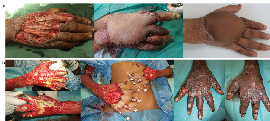
Fig. 2 Distant fasciocutaneous flap transfers to the upper limb. a Groin flap for a missile injury of the right hand: a flap repositioning was required after limited distal necrosis. b Multiple abdominal flaps for a burn injury of both hands: note the flap loss on the right 5th finger

In modern reconstructive units within well-provisioned healthcare facilities, soft tissue reconstruction is individually tailored to the wound, available and reliable flap sources, associated injuries and specific rehabilitation goals for each patient [1]. In battlefield MTF environment, however, the choices for soft tissue coverage methods are restricted. Factors that affect treatment decisions include the surgeon’s expertise and available resources (e.g., surgical equipment, antibiotics, laboratory analysis facilities and the number of available beds) [4]. For these reasons, the simplest solution for coverage is always preferred [4, 6]. In our experience, pedicled flaps combined with skin grafts allowed reconstruction of almost all types soft tissue extremity injuries, even large ones. Additional skin grafts were carried out together with flap transfers in most patients but were deferred in cases at risk of early infection. Simultaneous local, or distant, pedicled flaps were used successfully in this cohort as an alternative to free transfers [4, 6]. This decision was based on our limited experience with such